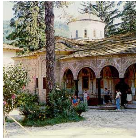
Troyanski Monastery, XVI c.